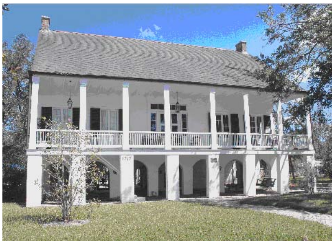
Elevation of a historic residence in Mandeville, Louisiana

While elevating a structure above the BFE will provide the structure the most protection, a less intrusive elevation may be desired or more feasible for a historic structure. Other protection measures, such as elevating utilities and equipment above the BFE, should be considered if elevating a historic structure to the BFE is not practicable.