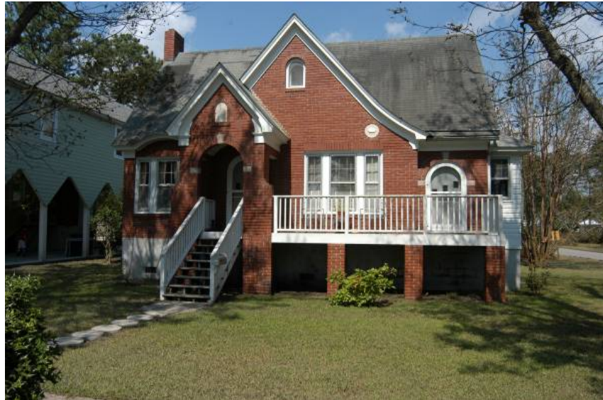
Frame building elevated on concrete block foundation faced with brick veneer. Belhaven, North Carolina.

With assistance from the North Carolina State Historic Preservation Officer, plans were developed for an elevation project that would best preserve the historic character of the district. In the plan, frame buildings were raised onto concrete block foundations faced with brick veneer. Brick buildings were elevated onto